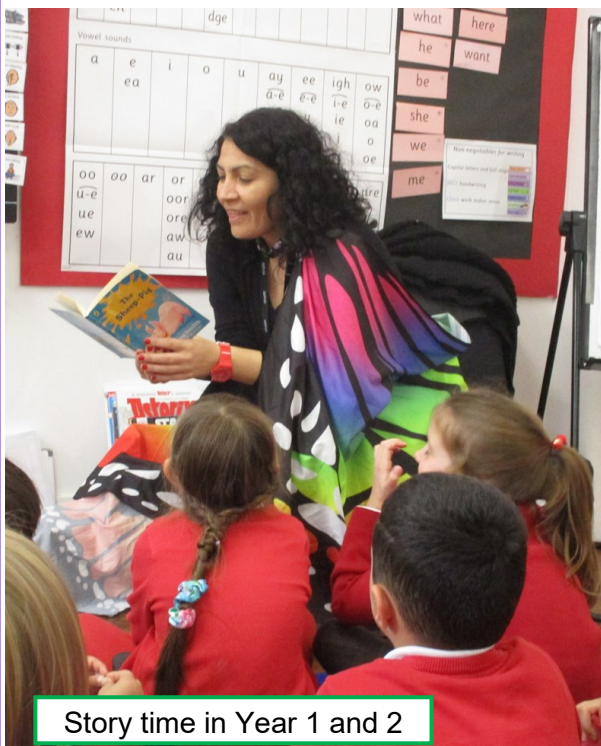
Story time in Year 1 and 2

All the teachers read to the children every day as part of story time . We choose these books because they are high quality and are from a variety of different authors and genres, e.g. mystery and adventure fiction, poetry and non-fiction. This is an exciting part of the day and the children love talking about the stories they've heard!