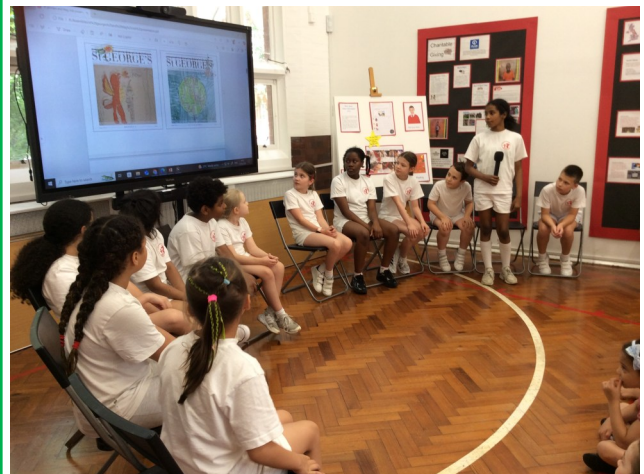
ST GEORGE'S MAGAZINE CLUB